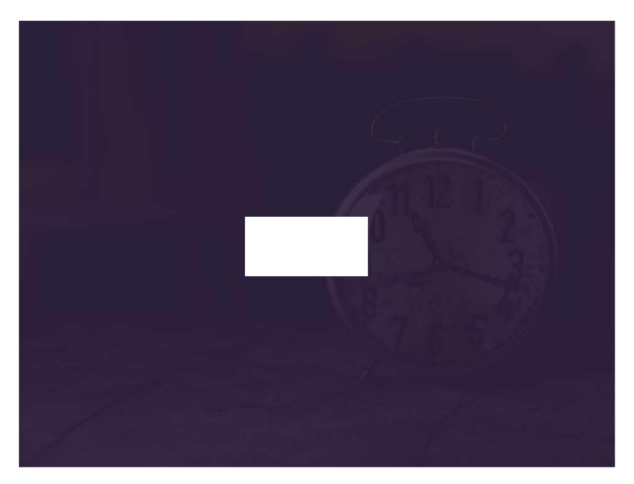
Regent Studies | www.regentstudies.com